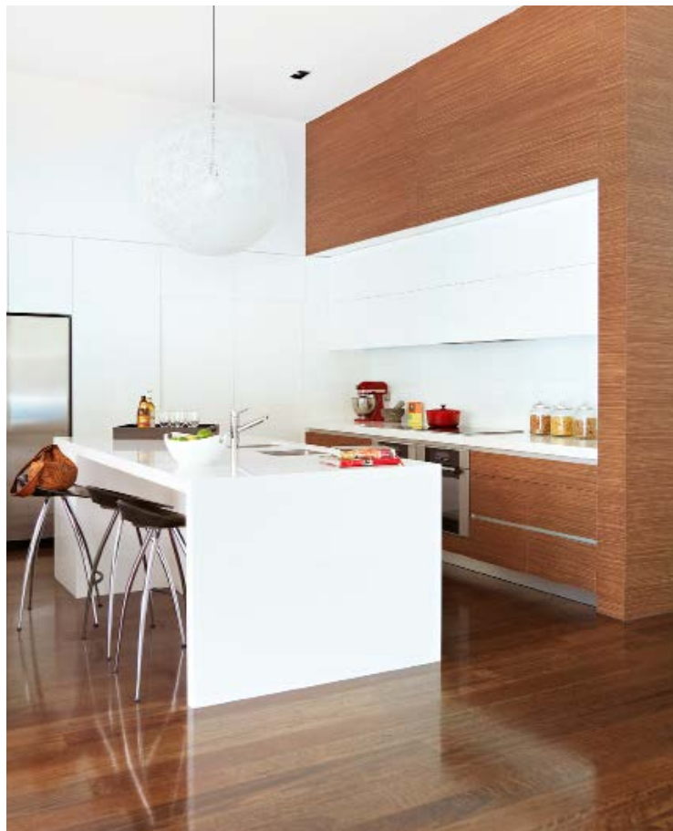
CLOCKWISE FROM ABOVE LEFT A vintage poster from the Letitia Morris Gallery brightens a wall in the open-plan area. Chairs from Retail Therapy Interior Design. The sleek kitchen has an island bench in Caesarstone Snow. Joinery in Sublime Walnut Laminex. A breakfast bar on the eastern side of the kitchen opens to the outdoor dining area. In the living area, the TV is mounted in a custom-made frame. Floor lamp from Artemide. Sofas from Jordan. Rug from Designer Rugs. OPPOSITE Jack, 13, enjoys a book in the open-plan kitchen/dining/living zone. Frameless bifold doors open out onto the courtyard. For Where to Buy, see page 204.