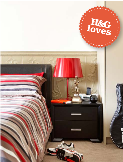
TOP Colour was kept to a minimum in the main bedroom. Grasscloth wallpaper from Baresque. Tolomeo bedside lights from Artemide. Wicker chair from Retail Therapy Interior Design. Throw from Moss Melbourne. BOTTOM Jack's bedroom, at the front of the house, retains the original pressed-metal panels. Lamp from Ikea. OPPOSITE In the glamorous ensuite, the couple opted for Bisazza mosaic wall tiles and Romeo Babe wall-mounted lights from Euroluce. Floor tiles, basin and tap from Reece. For Where to Buy, see page 204.