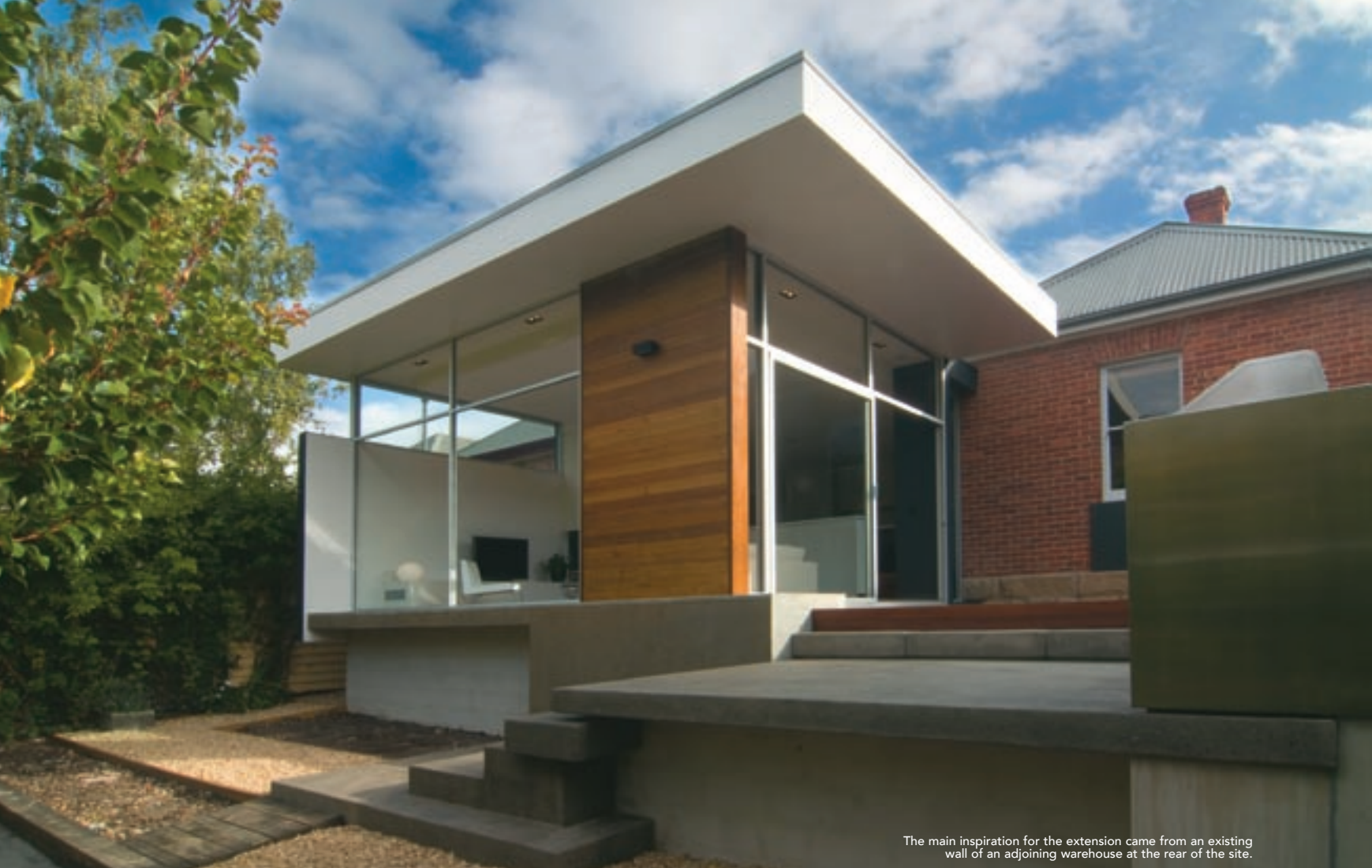
The main inspiration for the extension came from an existing wall of an adjoining warehouse at the rear of the site.