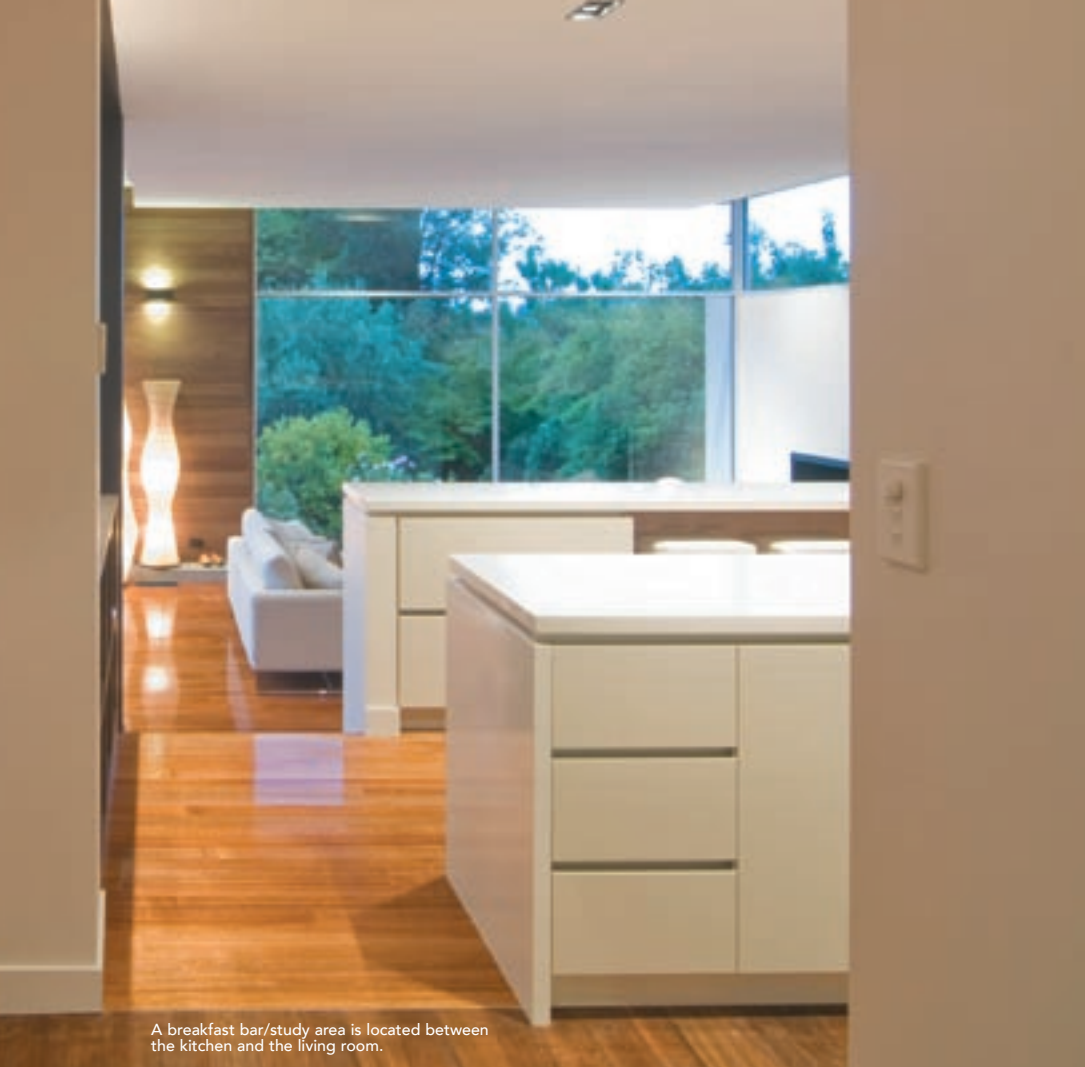
A breakfast bar/study area is located between the kitchen and the living room.