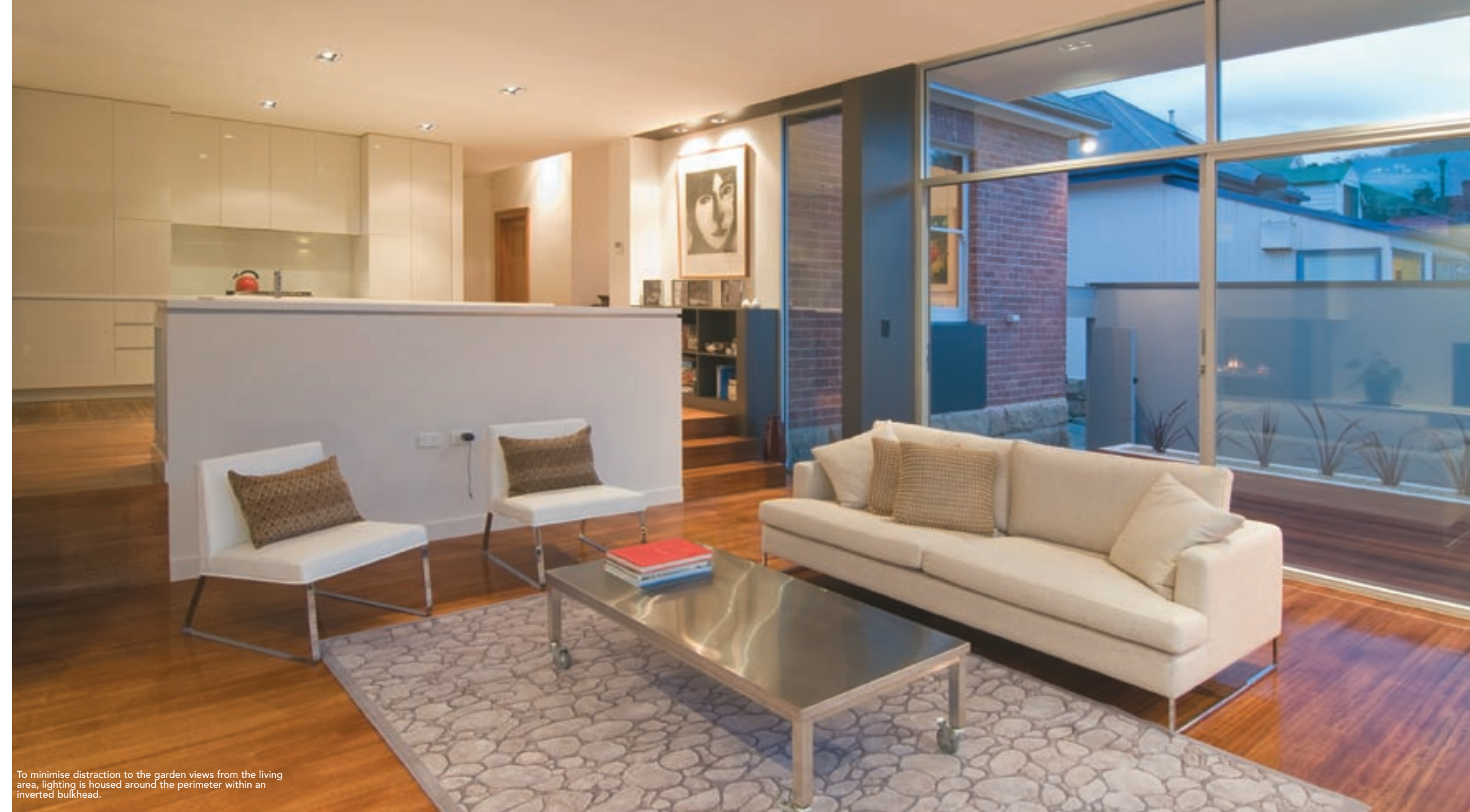
To minimise distraction to the garden views from the living area, lighting is housed around the perimeter within an inverted bulkhead.