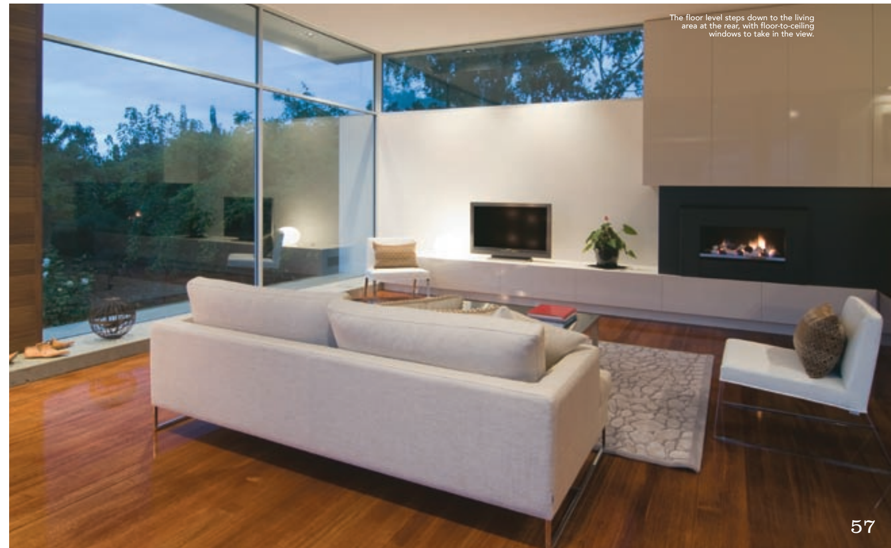
The floor level steps down to the living area at the rear, with floor-to-ceiling windows to take in the view.

The floor level steps down to the living area at the rear and the overhead